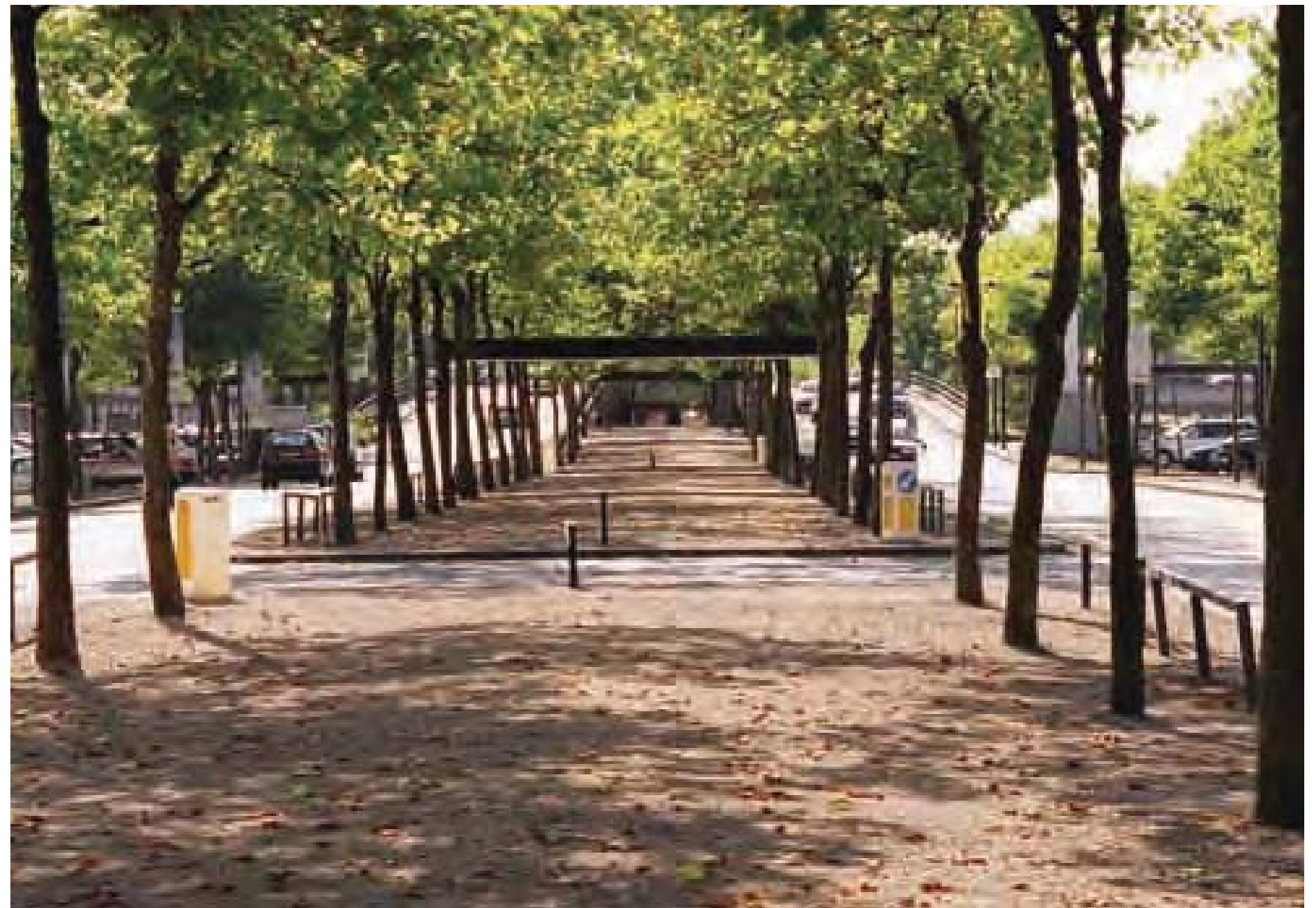
London Planes line CMK's Boulevards. Porte cocheres provide weather protection for pedestrians